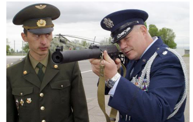
A Krygz Army Col. and U.S. military Attaché (USAF Lt Col) testing one of the Russian special purpose silenced assault rifles, AS "Val" delivered to the Krygystan's special forces at the Kant Base, Russia's first new military base on foreign soil since the collapse of the Soviet Union, near the Kyrgyz capital, Bishkek.