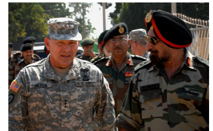
Army LTG Benjamin Mixon, commander of U.S. Army Forces in Pacific Command (PACOM), talks with the director of general military operations for India before a demo put on by the two nations' militaries at Camp Bundela, India, Oct. 26, 2009.

FAO Policy (DoDD 1315.17) was further revised on April 28, 2005, adding Title 10, Section 163, leveraging authority for the Combatant Commands (COCOMs), stating, "The COCOMs shall have the requisite war fighting capabilities to achieve success on the non-linear battlefields of the future." In February 2005, the Defense Language Transformation Roadmap was published and an additional DoD Instruction 1315.20 was signed on September 28, 2007. This instruction provided further guidance for the management of DoD FOA programs to include the establishment of a standardized format to be used by the military services, DoD components, and COCOMs for the Annual Report on DoD FAO Programs. The instruction also identified the Deputy Under Secretary of Defense for Plans within the Under Secretary of Defense for Personnel and Readiness as the principal staff advisor to the SECDEF for DoD FAO Programs.