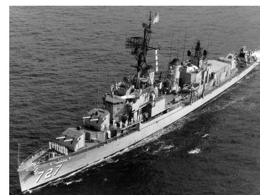
USS De Haven (DD-727), an Allen M. Sumner-class destroyer transferred to the Republic of Korea Navy in December 1973 renamed Incheon .

Complementary to UN initiatives, on April 21, 1971, President Richard Nixon proposed a realignment of foreign aid into two programs; one oriented to military assistance, the other to economic and humanitarian assistance. What became the International Security Assistance Act establishing foreign policy tools like foreign military sales (FMS), international training, and excess military equipment developed the term, "security assistance."