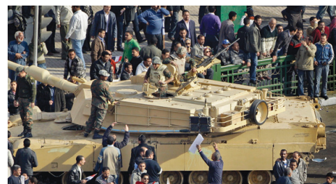
Egyptian Army tank in the middle of protestors. FMS have long been an instrument of U.S. diplomacy. By the end of 1981, Egyptian sales had reached $1.4 billion, managed by Security Cooperation Officers (SCOs).