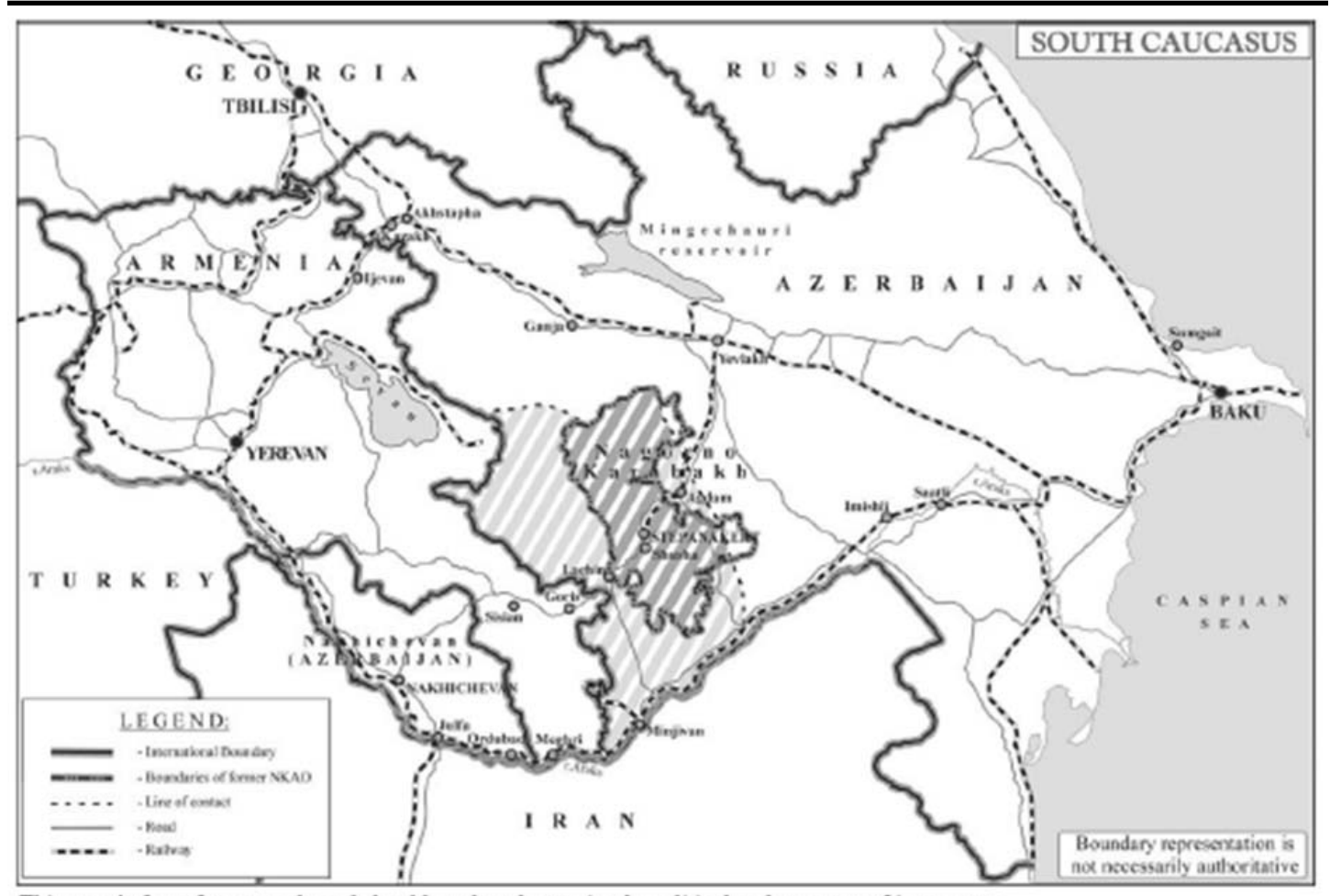
This map is for reference only and should not be taken to imply political endorsement of its content